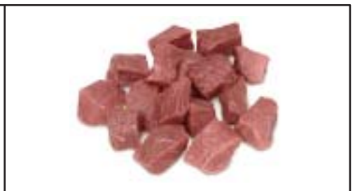
Lamb for Stew (Braise)

The above cuts are a partial representation of lamb cuts available.