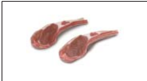
Rib Chops (Broil, Grill, Panbroil, Panfry, Roast)