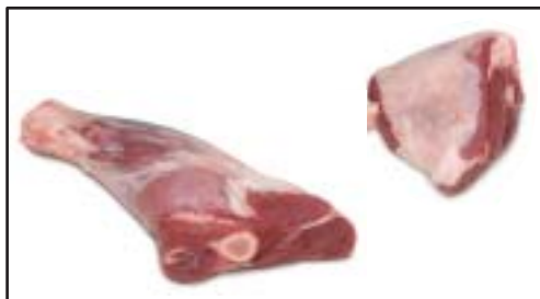
Shanks - Foreshank & Frenched Hindshank (Braise)