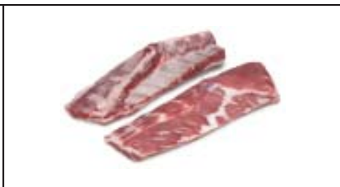
Spareribs (Denver Ribs) (Braise, Broil, Grill, Roast)