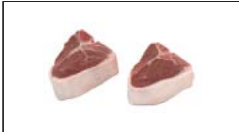
Loin Chops (Broil, Grill, Panbroil, Panfry)