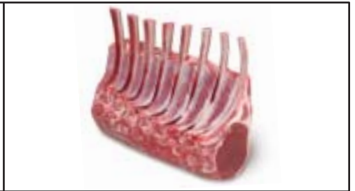
Frenched Rib Roast (Broil, Grill, Roast)