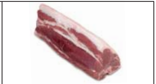
Loin Roast (Roast)