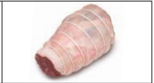
Boneless Leg Roast (BRT) (Roast)