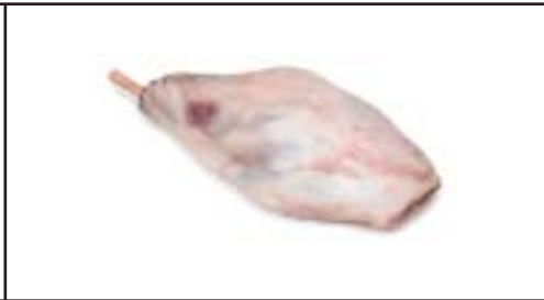
Frenched-Style Leg Roast (Roast)