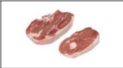
Shoulder Chops - Blade & Arm (Braise, Broil, Grill, Panbroil, Panfry)