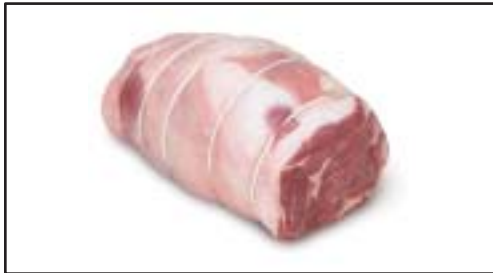
Boneless Shoulder Roast (BRT) (Braise, Roast)