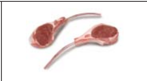
Rib Chops, Frenched, Special (Broil, Grill, Panbroil, Panfry, Roast)